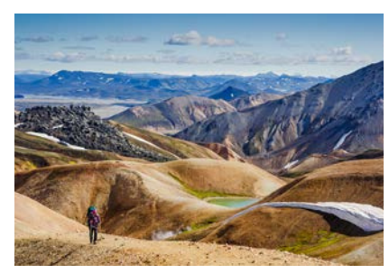
Travel to the interior highlands