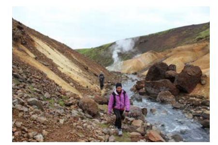
Walking and hiking tours