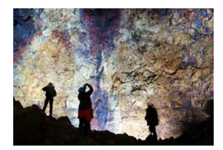
Lava caves and tunnels