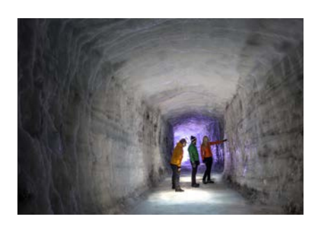
Man-made ice cave at Langjökull glacier