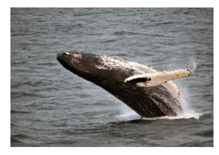
Whale and dolphin watching