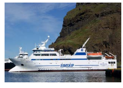
Ferry trip to the Westman Islands