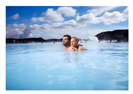
Bathing in geothermal lagoons