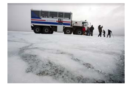
Monster truck and ice cave tours