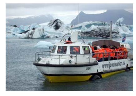
Boat trip between floating icebergs